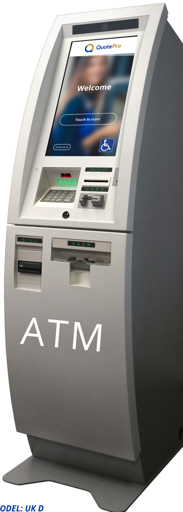
MODEL: UK D